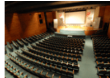
Crowne Plaza Moscow WTC

Moscow, Russia Supremely comfortable guest rooms, modern facilities and top class service; 30 adaptable conference halls and meeting rooms, including a multifunctional Congress Hall seating 1,500 provide wireless Internet available in all public areas, conference halls and guest rooms. Rooms and Suites 724 Theater 1,500, Classroom 800, Reception 1,000, Banquet 800 See more details!