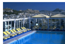
Athens Ledra Marriott

Beijing, China Adjacent to the remaining ancient Ming Dynasty City Wall and a 5 minute driving to Forbidden City, Tiananmen Square, and Silk Market the hotel provides the newest conference technology and all services required to support your successful event. Rooms and Suites 649 Theater 1,100, Classroom 600, Reception 1,100, Banquet 720 See details here!