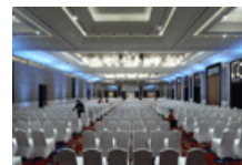
Beijing Marriott Hotel City Wall

Stockholm, Sweden Showcase facilities for conferences, product presentations or education in the heart of Stockholm: flexible premises, meeting rooms for up to 200 delegates. Meals and coffee-breaks are served in the Winter Garden, which is also the perfect location for exhibitions or receptions. Rooms and Suites 292 Theater 200, Classroom 70 See details here!