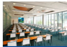
Andel's Hotel Prague

Buenos Aires, Argentina Argentinas capital and largest city is located on the Río de la Plata's western shore, on the southeastern coast of the South American continent. The Buenos Aires Convention & Visitors Bureau is supported by the Government of the City of Buenos Aires and by public and private organizations; and offers various alternatives for a successful event organization in Buenos Aires. See more details!