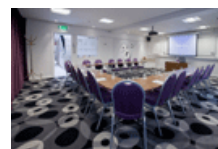
Rica Hotel Stockholm

Stockholm, Sweden Showcase facilities for conferences, product presentations or education in the heart of Stockholm: flexible premises, meeting rooms for up to 200 delegates. Meals and coffee-breaks are served in the Winter Garden, which is also the perfect location for exhibitions or receptions. Rooms and Suites 292 Theater 200, Classroom 70 See details here!