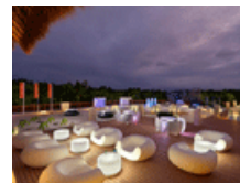
Paradisus Playa del Carmen

Playa del Carmen, Mexico Find an uncompromised level of quality and service in this two-in-one property: "La Perla", an adult's only resort, offers unbeatable services and is completed by "La Esmeralda" featuring extraordinary services to everybody. Both resorts offer combined a high-end MICE infrastructure. Rooms and Suites 906 Theater 500, Classroom 400, Reception 1,500, Banquet 900 See details here!