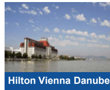
Hilton Vienna Danube

Vienna, Austria Refurbished: Vienna's largest guest rooms are completed by the new built Grand Waterfront Hall. A perfect setting for major events. Enjoy spectacular views over the Danube River and perfectly located only 7 minutes from the city center / 15 minutes to the Airport.