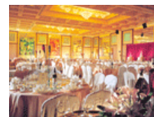
Meritus Shantou China