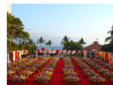
CasaMagna Marriott Puerto Vallarta Resort & Spa